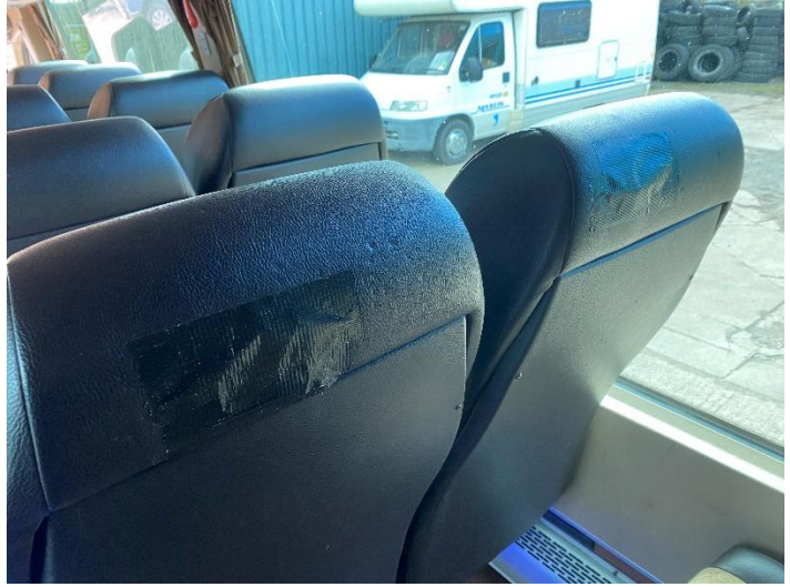
Damage to the rear backs of 3 seats. 2 seats have been cut/pen pricked and other has been scratched. These seats are in front of the back row.